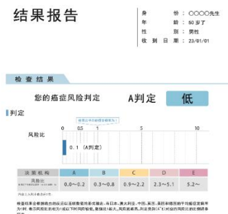
6) After returning to home country, receive results on MyPage (Results expected by: (Results expected by: in a few weeks)