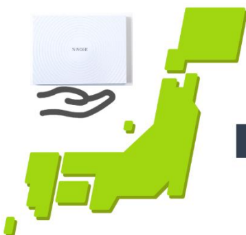
4) urine sampling after arriving in Japan