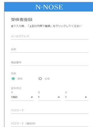
3) Register MyPage