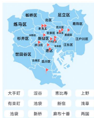
5) submitting the urine sample in to a collection area within Tokyo